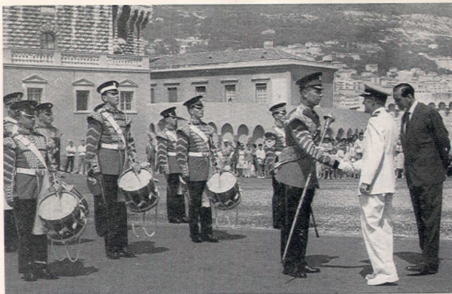
The Corps of Drums of the Junior Guardsman's Company will be representing Great Britain at The British Trade Fair in Zurich later this year.